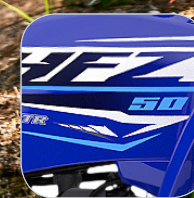
Team Yamaha Blue