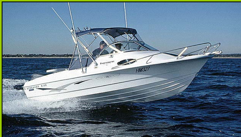
Streaker Tournament 585

Test Conditions People: 2 Air Temp: 27 Wind Speed: 5 Knots Fuel (Litres): 80 of 175 Water Temp: 22 Deg C Wind Direction: Easterly Conditions: Fine/Clear